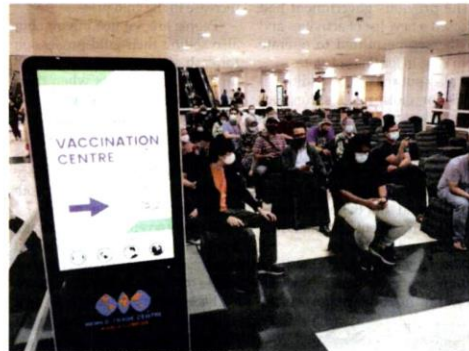
Around 90% of the state's adult population had been inoculated, and at least 56% of them had received the 2nd jab, says MB

Amirudin said the proposal to move to the next phase had been brought to Health DG Tan Sri Dr Noor Hisham Abdullah's attention, who agreed that the reopening of