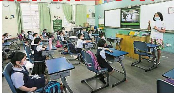
由于我国冠病疫情仍严重, 每日确诊病例仍过万宗, 雪隆华校董事会联合会及巴生县华小发展工委会皆赞成展延分阶段复课日期展延至10月3日。

“其实, 学校在10月复课, 已接近年杪学校假期, 如果无法在今年复课, 展延至明年才复课也不失为一个好方案。”