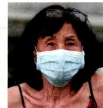
Sobey says residents are thankful that they can use the field to ensure their mental well-being.

"In fact, it is the large field that has attracted many people to buy houses in this area, as green spaces do create a pleasing ambience."