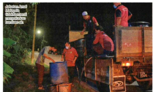
Jabatan Amal Malaysia tidak berhenti menyalurkan bantuan air.

Selain agensi negeri dan Persekutuan, turut bertanggungjawab membantu menyalurkan bantuan air adalah wakil-wakil rakyat,