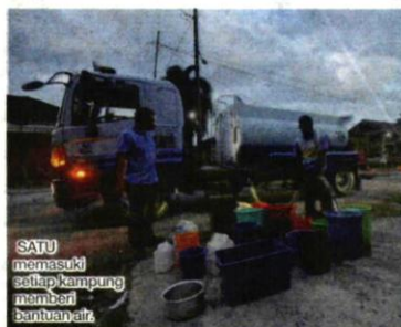
SATU memasuki setiap kampung memberi bantuan air.

"Antara yang dilaksanakan seperti penyediaan 117 tangki air berkapasiti 500 hingga 600 gelen di setiap kampung dan JPKK untuk bekalan air diambil sendiri oleh rakyat," katanya.