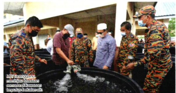
MB Terengganu meninjau keadaan semasa di kawasan terputus bekalan air.

Jawatankuasa Pembangunan dan Keselamatan Kampung (JPKK) dan badan bukan kerajaan seperti Jabatan Amal Malaysia, Iman Care serta Khidmat Malaysia.