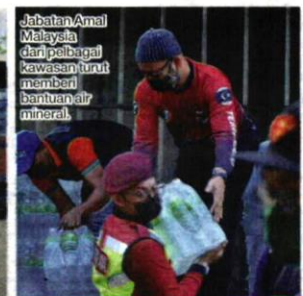
Jabatan Amal Malaysia dan pelbagai kawasan turut memberi bantuan air mineral.